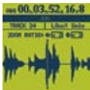
Waveform screen with variable zoom.